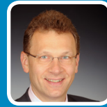
CARLOS JIMENEZ HÄRTEL CTO & CIO GENERAL ELECTRIC EUROPE